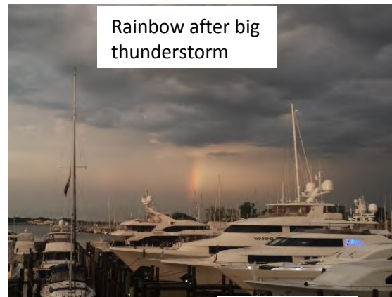
Rainbow after big thunderstorm

Following our celebration of the sun's northernmost transit, we continued further up the bay stopping in anchorages and marinas which included Reedville (must stop for dinner at the Crazy Crab), Solomons, and our northern most port. Annapolis, a great layover, but best remembered this year of a picture taken of my boat moored next to the mega yachts, one of which is owned by the owner of the Baltimore Ravens. It was this perspective which brought to light how small our boats really are. Staying two nights in Annapolis we got underway once again for a very short transit to Clements Creek off the Severn, a beautiful cliff lined creek offering superb protection (put to use that evening with one of the many thunderstorms that passed our way) and unspoiled beauty. In addition to the protection provided by the cliffs, all of us had opted to pick up one of the Naval Academy mooring balls vice anchoring. These mooring balls positioned in the various creeks off the Severn are the Academies hurricane anchorages adding to our sense of security. Dinner that night was a BBQ hosted by a friend of mine which lives in this Annapolis neighborhood, and we could not have asked for a better evening, not to mention some of the best ribs I have ever had.