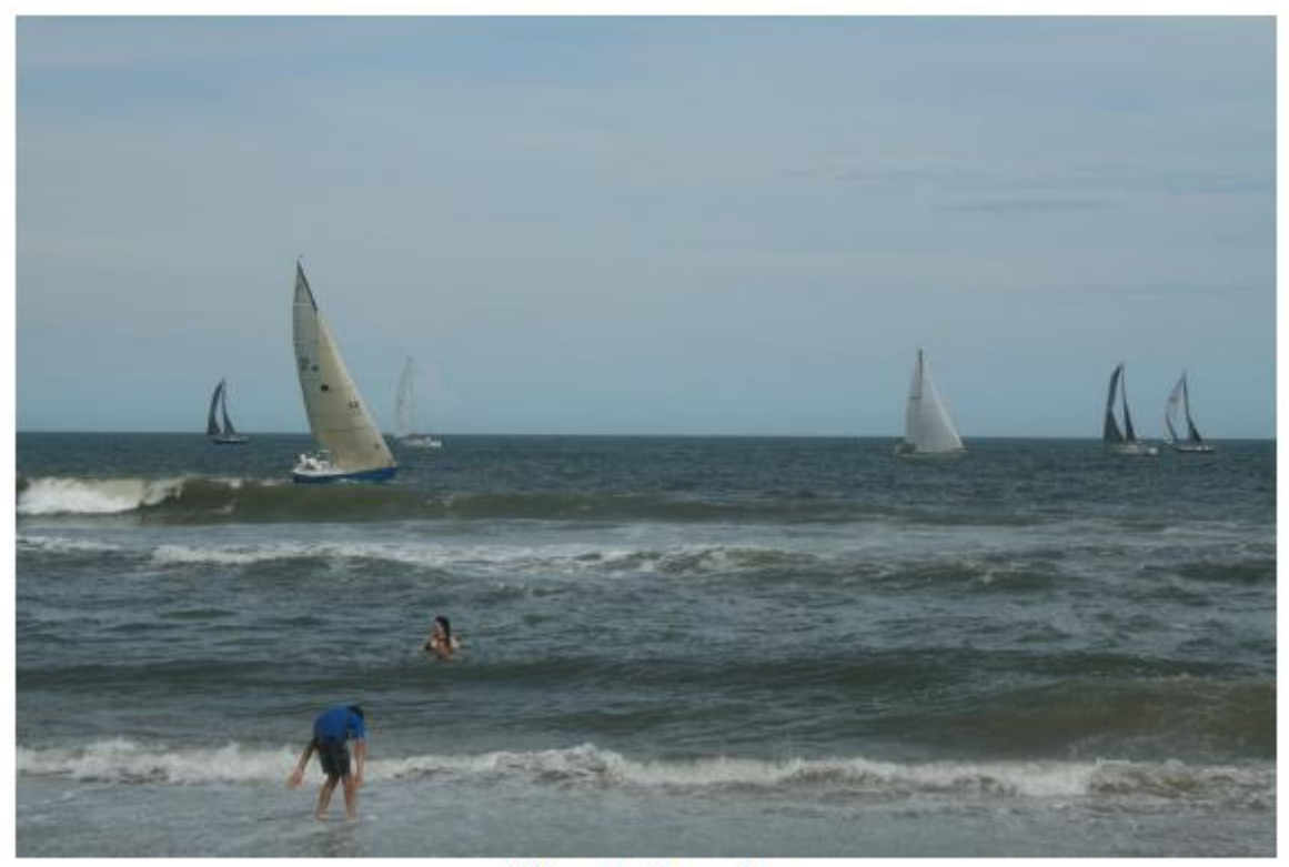
Atlantic Regatta September 26, 2020

Fall is right around the corner, which means this race is not too far away! Unfortunately the Neptune festival has been cancelled, but the race is still on.