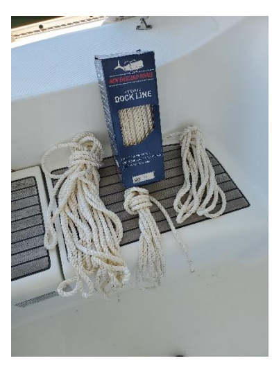
1/2" Dock line never used. 1 50' line left. $25 OBO

Contact info is <a href="mailto:karl.shulenburg@gmail.com">karl.shulenburg@gmail.com</a> or (757) 374-6034.