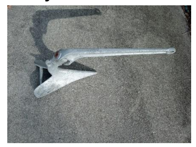
30 lb CQR galvanized anchor- $50.00