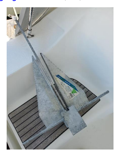
25-pound Danforth anchor. Came with the boat when we bought it. Never used as evidenced by the intact label plate. New costs roughly $140. I'm good at $40... OBO