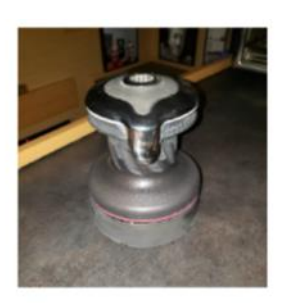
For Sale Harken 35 Manual Winch Two Speed Self-tailing $400

Just removed from a 2017 Lagoon 42 where it was used only for furling the jib. Replaced with larger 46 in prep for flying a spinnaker. Average new price is approximately $850.