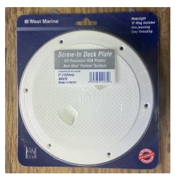
West Marine 6 inch Deck Inspection Plate, $10.