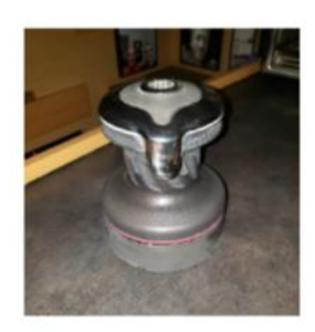
For Sale Harken 35 Manual Winch Two Speed Self-tailing $400

Just removed from a 2017 Lagoon 42 where it was used only for furling the jib. Replaced with larger 46 in prep for flying a spinnaker. Average new price is approximately $850.