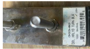
3 Series Double Deck Organizer. Sheaved for 11mm max line, $35.