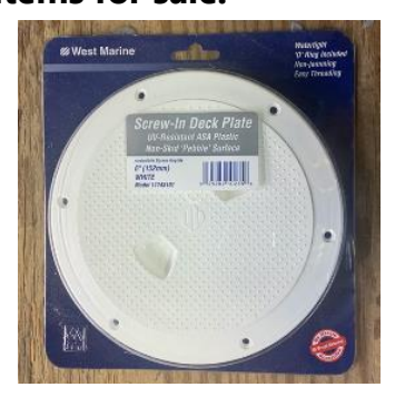
West Marine 6 inch Deck Inspection Plate, $10.