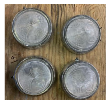
6-inch White light Stainless Steel Cabin Dome Lights, $35 set or $5 each.