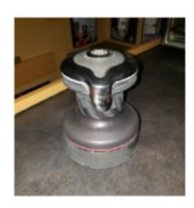
For Sale Harken 35 Manual Winch Two Speed Self-tailing $400

Just removed from a 2017 Lagoon 42 where it was used only for furling the jib. Replaced with larger 46 in prep for flying a spinnaker. Average new price is approximately $850.