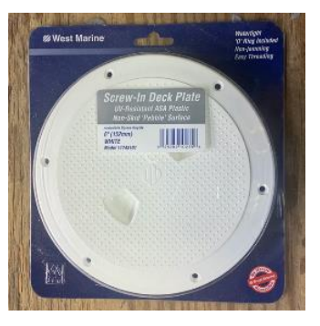
West Marine 6 inch Deck Inspection Plate, $10.