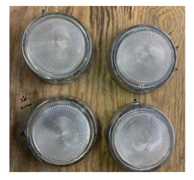
6-inch White light Stainless Steel Cabin Dome Lights, $35 set or $5 each.