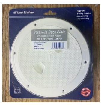
West Marine 6 inch Deck Inspection Plate, $10.